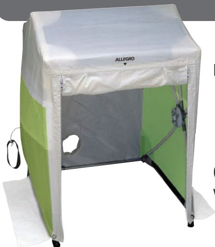
Deluxe Work Tent