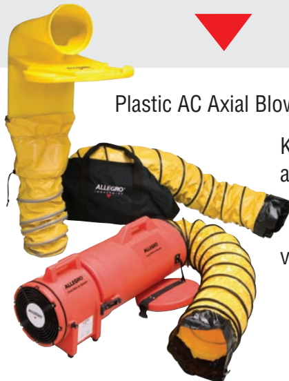
Plastic AC Axial Blower Kit

Kit includes 6 ft. and 15 ft. ducting, storage bag, and 8 in. manhole ventilation passthru