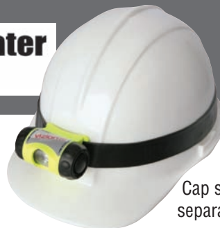
Cap Lamp 3AAA (CL I Div 1)