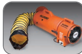
Plastic AC Ventilation Blower