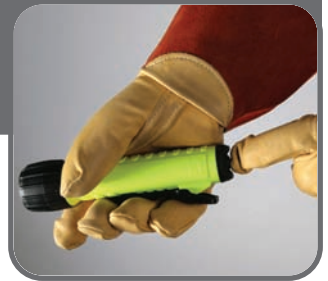
Gator Flashlight 3C (CL I Div 1)