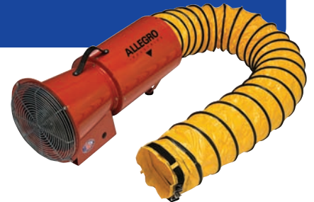
Steel AC Ventilation Blower