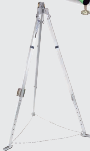
7 ft Aluminum Tripod