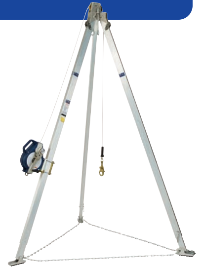
Ultra-Lok 50 ft. Retrieval Kit 3-Way SRL with Tripod