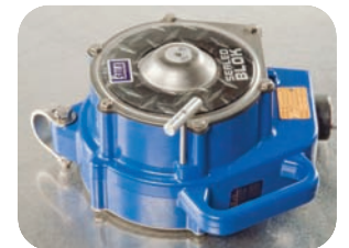
Sealed-Blok SRL 50 ft. Retrieval Device