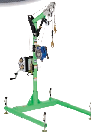
Advanced 5-Piece Davit Hoist System with Mechanical Devices