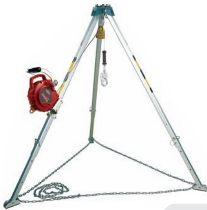
Rebel 50 ft. Retrieval Kit 3-Way SRL with Tripod